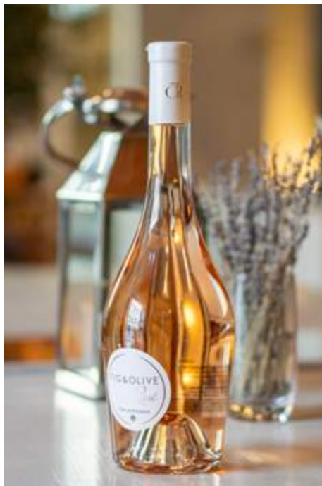
Fig & Olive Rosé

https://www.eatmeguiltfree.com/collections/all-protein